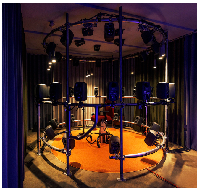
Figure 2. Picture of the Spatial Audio Lab where the speech intelligibility test was performed.

After two training lists (20 sentences per list), a third list (20 sentences) was run adaptively to assess the individual speech reception threshold to achieve 50% correct (SRT50) with the Universal program for speech coming from the front. The test was then performed at two fixed SNR conditions, namely at the individually obtained SRT50 (very challenging condition), as well as at SRT50+3 dB SNR (challenging but more manageable condition). The target speech was presented either from 0° (speech from the front) or +90° (speech from the right side), with one list (20 sentences) for each target angle. Before the start of each sentence, an acoustic cue (1 kHz pure tone of 100 ms in duration) was played from the front loudspeaker to alert the participants of the incoming target sentence. After the end of the sentence, the participants were instructed to repeat the sentence. The percentage of correctly repeated words was reported (word score).