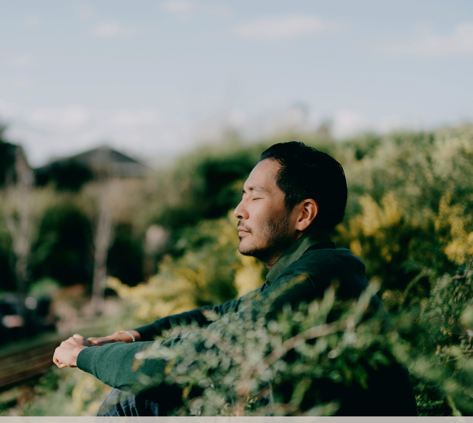
AN INTRODUCTION TO